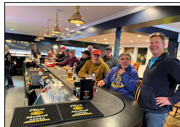
The scene at a recent Wednesday afternoon Club social hour, "Mixed Nuts".